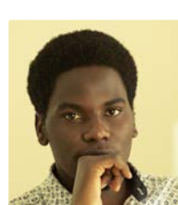
Andrew Bugembe Photography